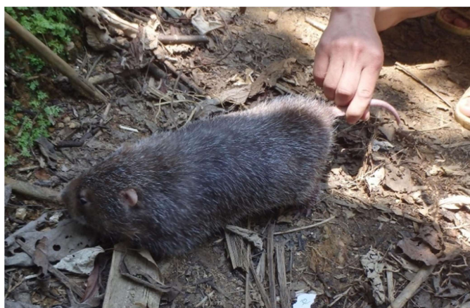
Figure 2. R. prinosus , typical wild - type colouration, Dien Bien province